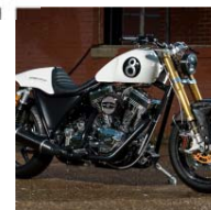
The New BRAWLER GT from Brass Balls Cycles